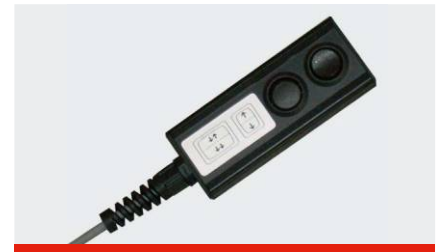
Remote control with cable